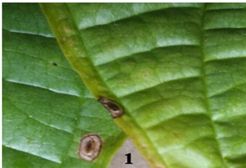
Plate A Fig. 1: Leaf blotches made on Dioscorea bulbifera by unknown lepidopteran larvae parasitized by Sympiesis almorensis .

carefully for the emergence of parasitoids. After the onset of emergence of parasitoids, all reared parasitoid specimens were collected from the rearing jars with the help of aspirator and preserved in 70% alcohol. For the observation of taxonomic characters, the procedure of permanent slide preparation was followed as prescribed by Noyes (1982). Olympus Magnus MSZ-TR (Binocular Stereo Microscope) was used to take various photographs and Olympus Trinocular Research Microscope Model- CX-31-Tr with drawing tube attachment was used for the drawing.